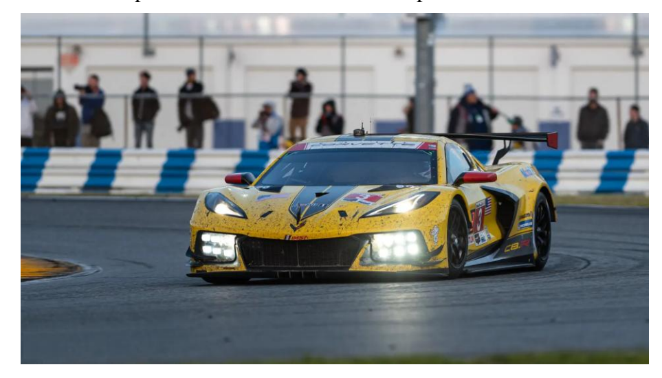
Read the full story here

DNF before they even start! General Motors confirmed to The Drive today that its brand-new Chevrolet Corvette C8.R race car will not be going to this year's rescheduled 24 Hours of Le Mans. Le Mans had been rescheduled from its traditional June date to Sept. 19-20 due to the COVID-19 pandemic.